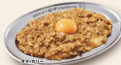
タナ・カレー Tanaka's original curry ¥620 ¥682 (Tax Inc.) 田中原創咖喱 田中特製咖喱 다나카의 오리진널 카레