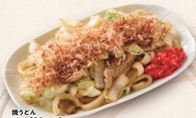
焼うどん Grilled Udon Noodles 炒烏冬 炒烏龍麵 아카우동 ¥620 ¥682 (Tax Inc.)