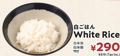
白ごはん White Rice 白米飯 白米飯 백반 ¥290 ¥319 (Tax Inc.)