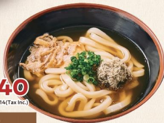
¥740 ¥814 (Tax Inc.)