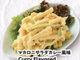
マカロニサラダカレー風味 Curry Flavored Macaroni Salad