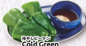
冷やレビニマン Cold Green Peppers