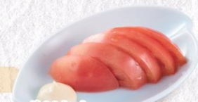
冷やレトマト Chilled Tomato