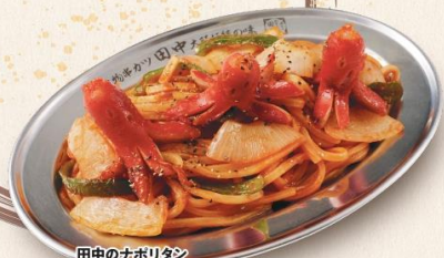
田中のナポリタン Tanaka's Ketchup-Based Spaghetti with Plum Sauce 田中特製那不勒斯意面 田中特製拿坡里義大利麵 다나카의 나폴리탄 스파게티 ¥620 ¥682 (Tax Inc.)