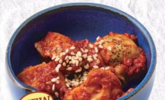
NEW つぶ貝キムチ Whelk Kimchi