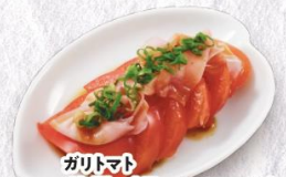
ガリトマト Pickled Tomato with Pickled Ginger