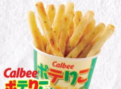
Calbee ポテリコ ポテリコ Poterico