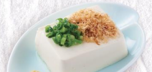
冷奴 Chilled Tofu