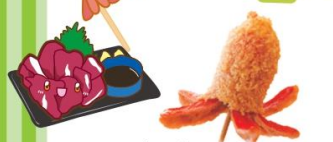
タコウィンナー Octopus Sausage 章鱼香肠 章鱼小香肠 문어 비엔나 ¥70 ¥77 (Tax Inc.)