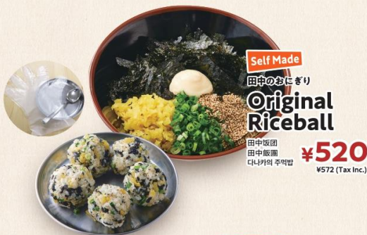
Self Made 田中のおにぎり Original Riceball 田中飯团 田中飯團 다나카의 우밥 ¥520 ¥572 (Tax Inc.)