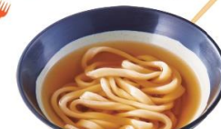
おこさまうどん Udon Noodles for Kids 儿童乌冬面 兒童用烏龍麵 어린이 우동 ¥290 ¥319 (Tax Inc.)