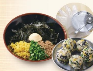
田中のおにぎり Original Riceball