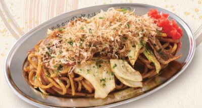
田中のソース焼きそば Fried Noodles with Tanaka's Special Sauce ¥620 ¥682 (Tax Inc.) 田中沙司炒荞麦面 田中式的日式炒麵 다나카의 소스 아카소바(볶음면)