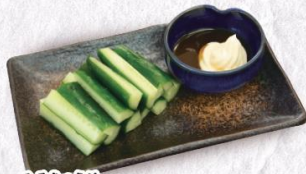
みそきゅうり Miso and Cucumber