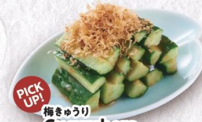
PICK UP! 梅きゅうり Cucumbers with Plum