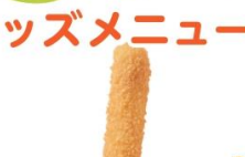
チーズ Cheese 奶酪 起司 치즈 ¥230 ¥253 (Tax Inc.)