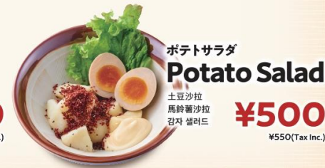
ポテトサラダ Potato Salad