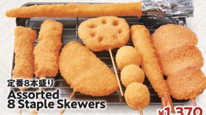
定番8本盛り Assorted 8 Staple Skewers

Beef, Pork, Onion, Lotus Root, Shrimp, Quail Egg, Red Pickled Ginger and Asparagus ¥1,370 ¥1,507 (Tax Inc.)