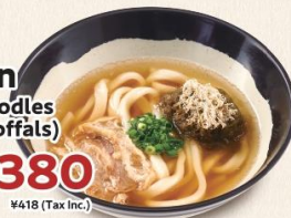
¥380 ¥418 (Tax Inc.)

Large Serving (1.5 portion) 大份(1.5团) 大碗(1.5球) 금액기(인 1.5배) 大盛り(1.5玉) +¥130 ¥143 (Tax Inc.)