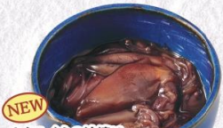
NEW ホタルイカの沖漬け Firefly Squid Marinated in Soy Sauce