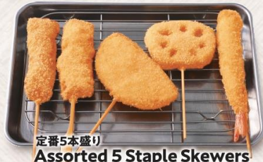
定番5本盛り Assorted 5 Staple Skewers

Beef, Pork, Onion, Lotus Root, and Shrimp ¥800 ¥880 (Tax Inc.)